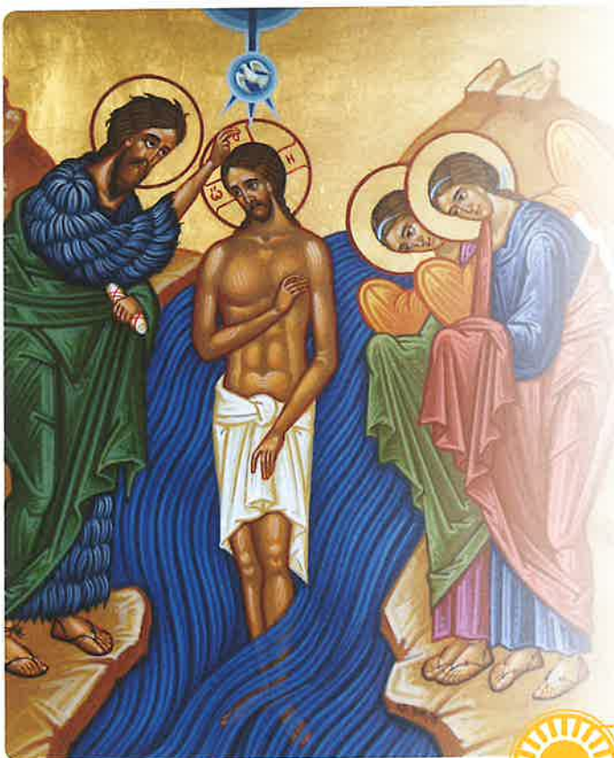
Baptism of Christ. Chapel of the Convent of the Holy Trinity in Lomnica, Vranov, Slovakia.