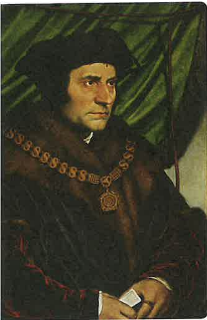
Sir Thomas More by Hans Holbein the Younger